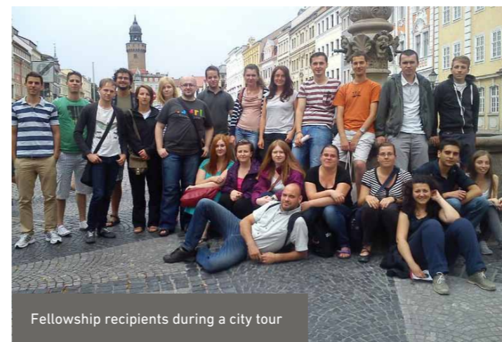
Fellowship recipients during a city tour