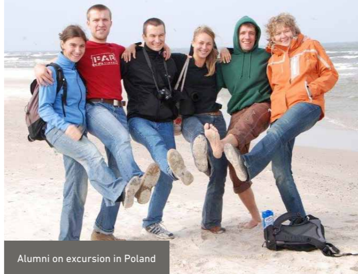
Alumni on excursion in Poland

During the fellowship practical solutions for current environmental issues are developed. After their stay in Germany the alumni are well qualified to tackle these issues in their home countries thus assuring efficient knowledge transfer. Working closely together in an international context helps to breakdown existing barriers. The acquired contacts will create a strong network of highly committed environmental experts.