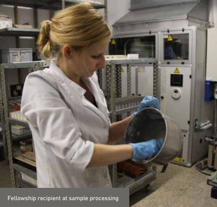
Fellowship recipient at sample processing